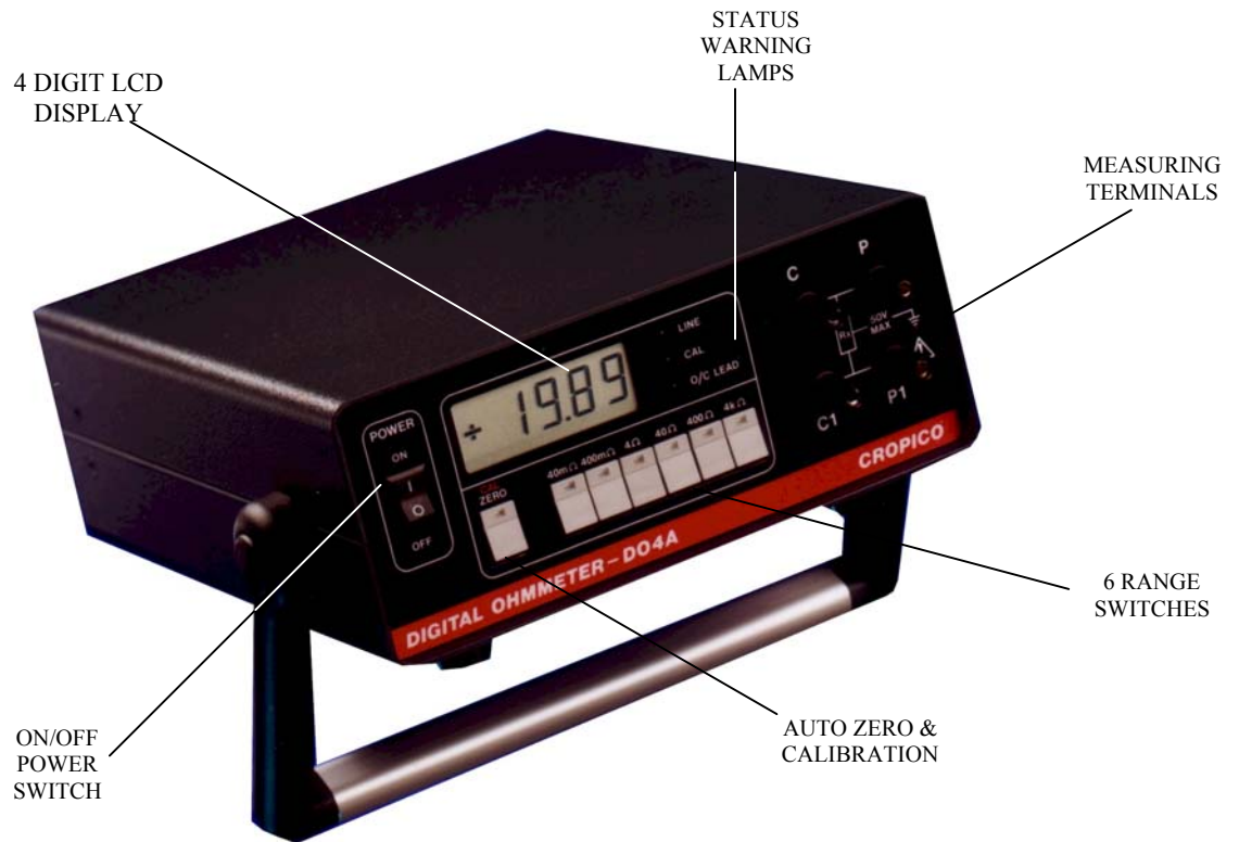
Fig. 8-1 Description of Controls