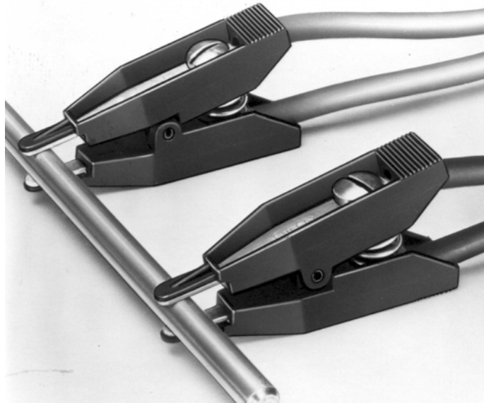
Fig. 8.2 Combined current and potential probes